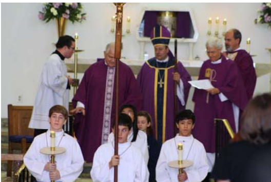
CROSIER ... a staff with a hooked end like a shepherd's crook, carried by Catholic bishops, symbolizing their roles of caring for their congregations as shepherds tend flocks